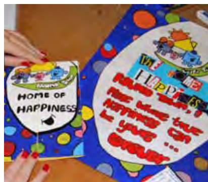
Examples of some of the creative work done by the workshop students.