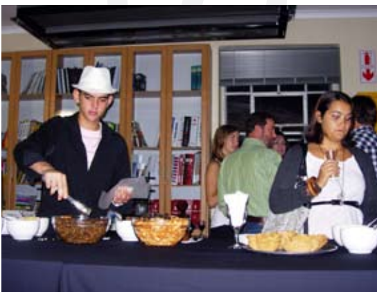
Attendees were invited to enjoy snacks and drinks while viewing the students work.

Parents, the public in general and Industry Professionals were invited to attend. The evening was a huge success with the students gaining a lot of industry exposure as well as being able to show off to their parents who were equally proud of their achievements.