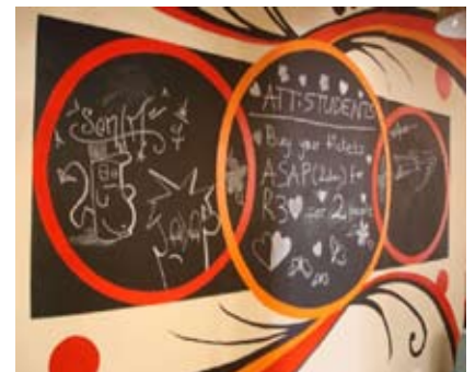
Some of the Cape Town design students busy painting the colourful info wall at reception

3rd year interior design students Lara and Carla came up with the idea to create an info wall on which students can comment with chalk.